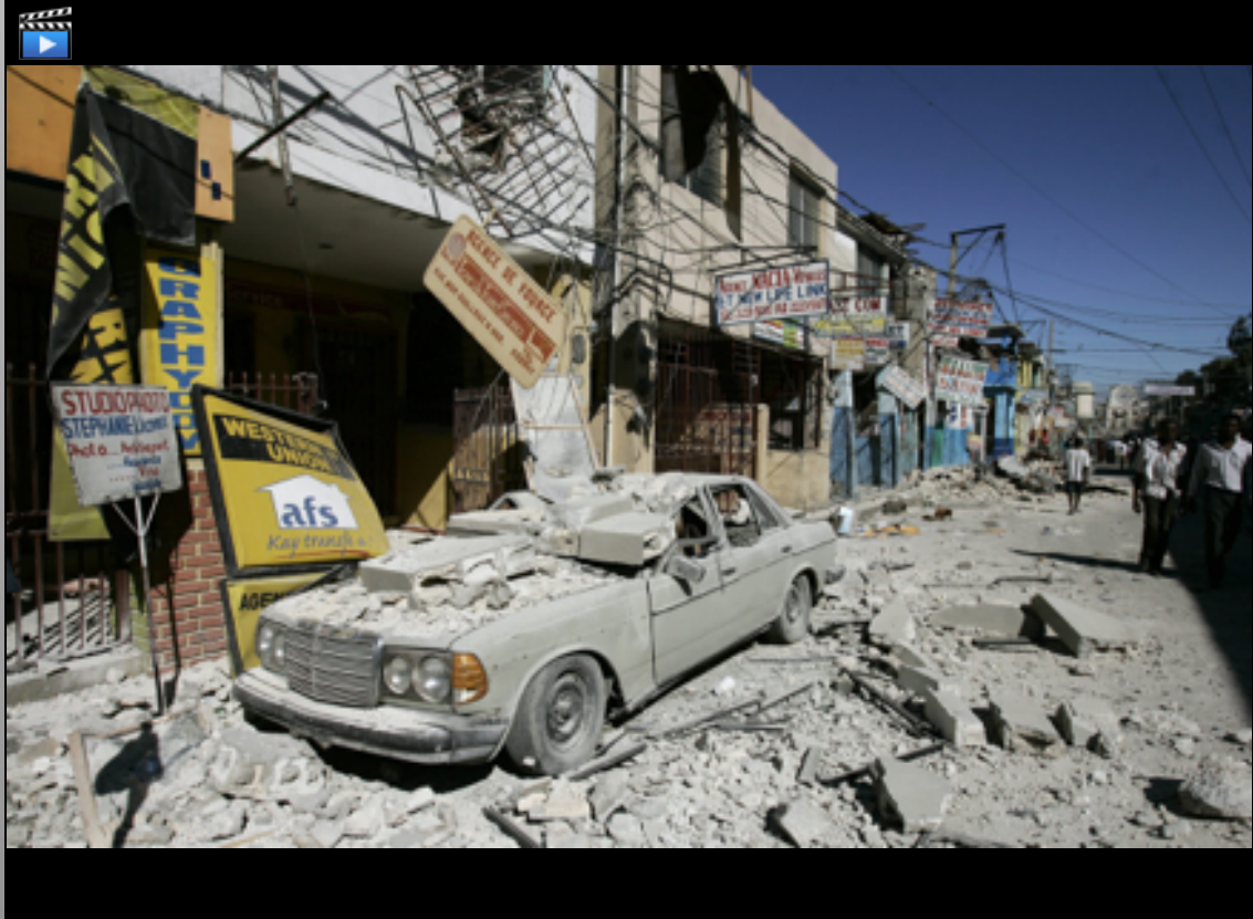
29. [Group] sermon-image-16.jpg