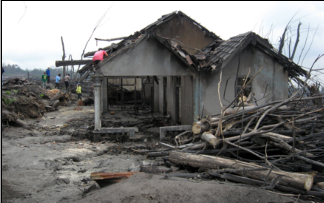
28. [Group] sermon-image-15.jpg