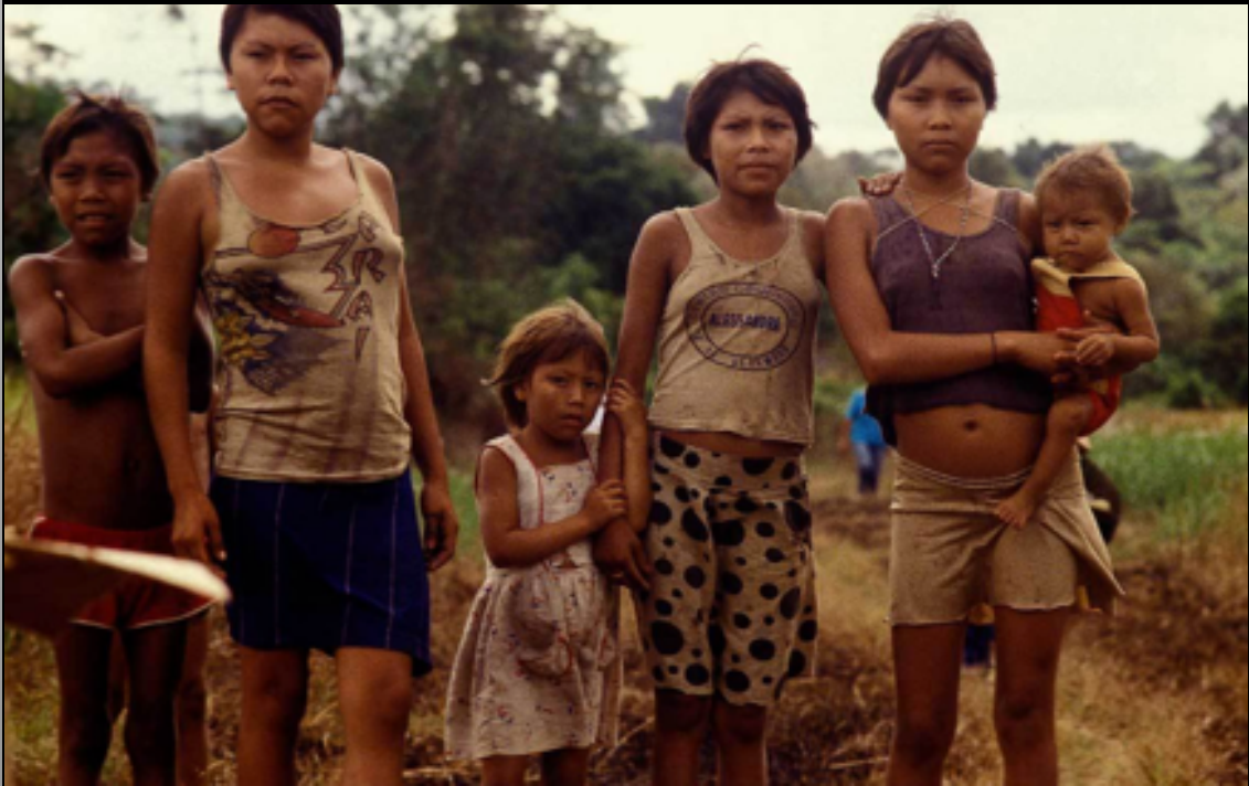
30. [Group] sermon-image-18.jpg