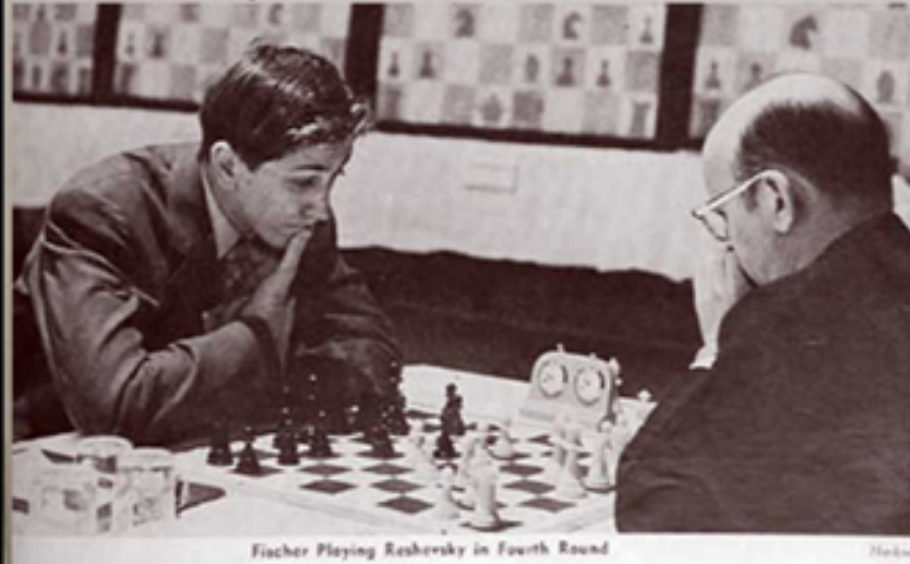
Fischer Playing Reshevsky in Fourth Round