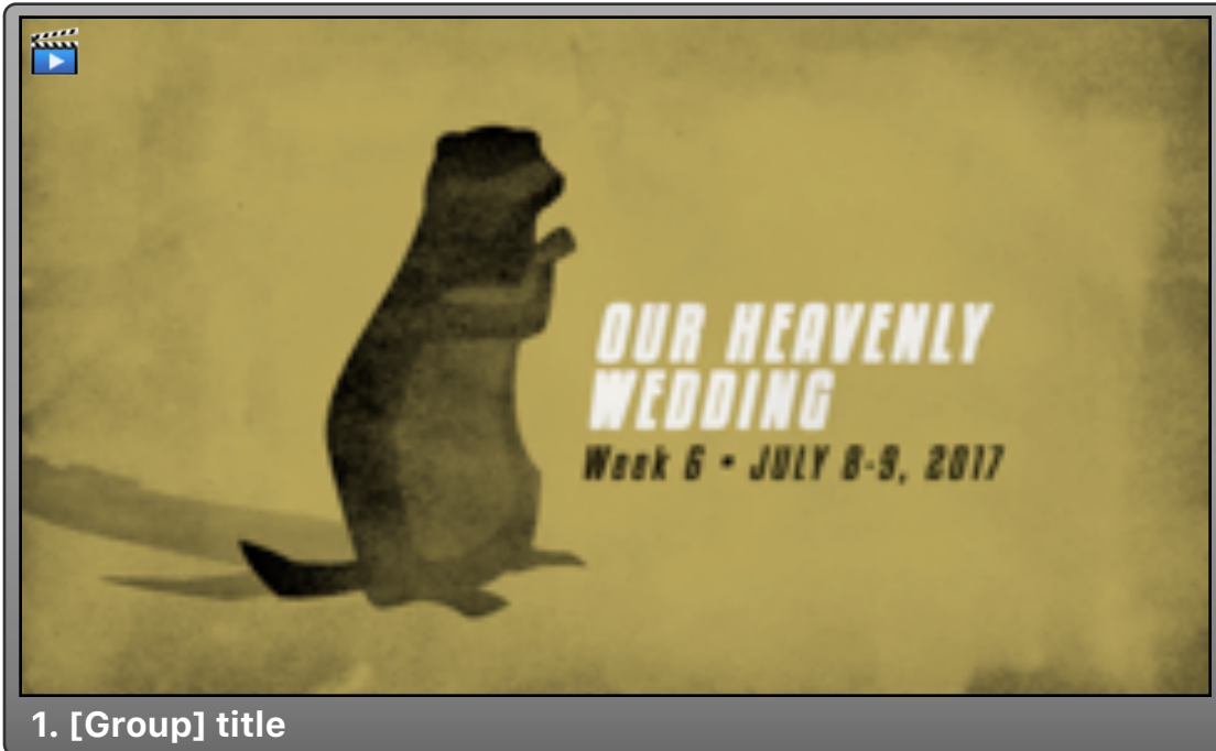
1. [Group] title