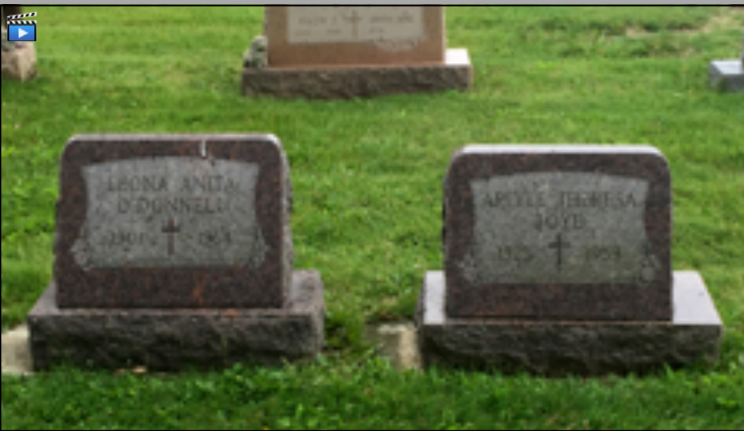
5. [Group] sermon-image-03