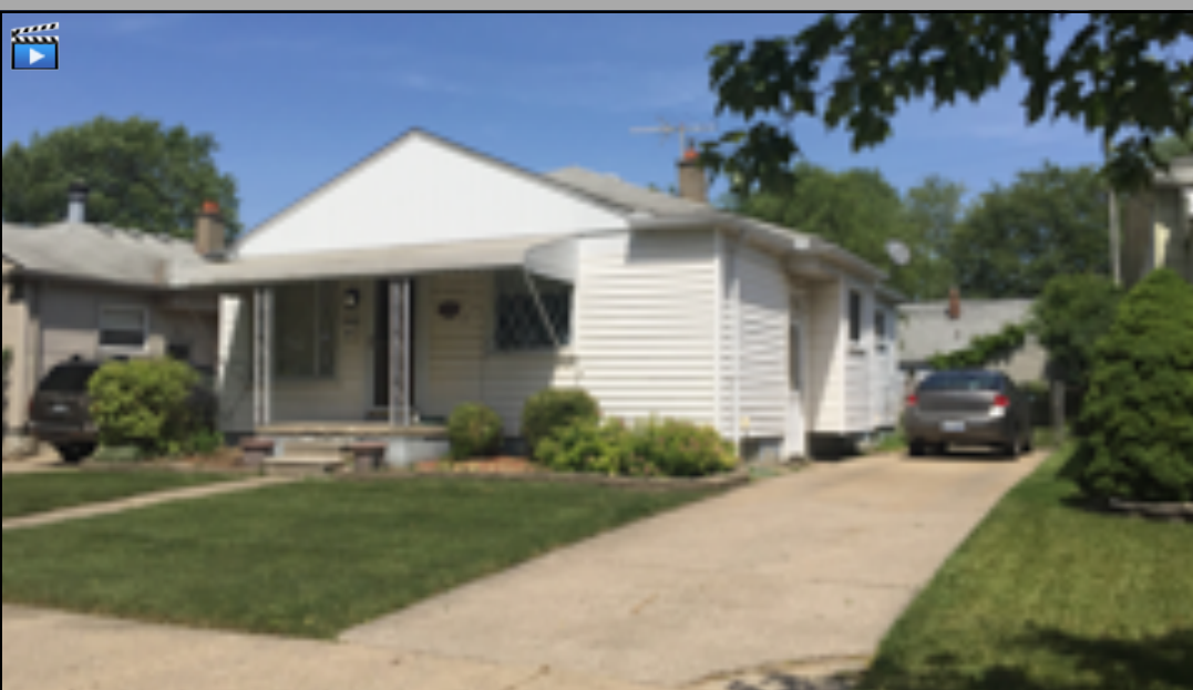
6. [Group] sermon-image-01