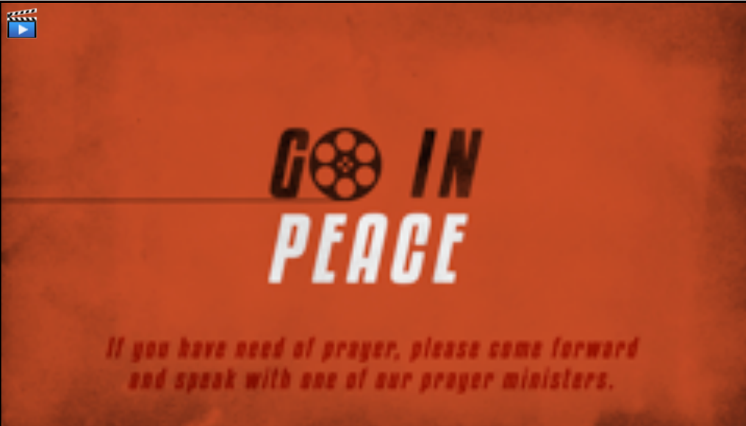
10. [Group] 00_go-in-peace