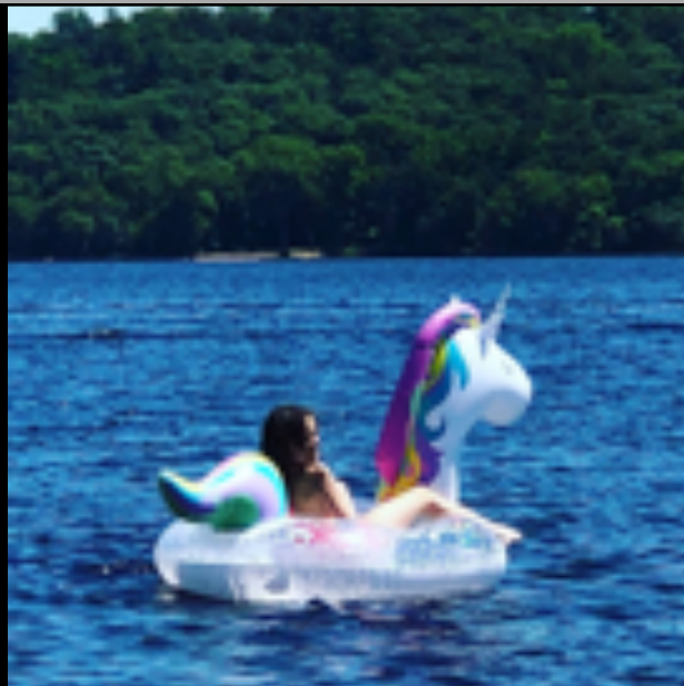
2. [Group] IMG_0259