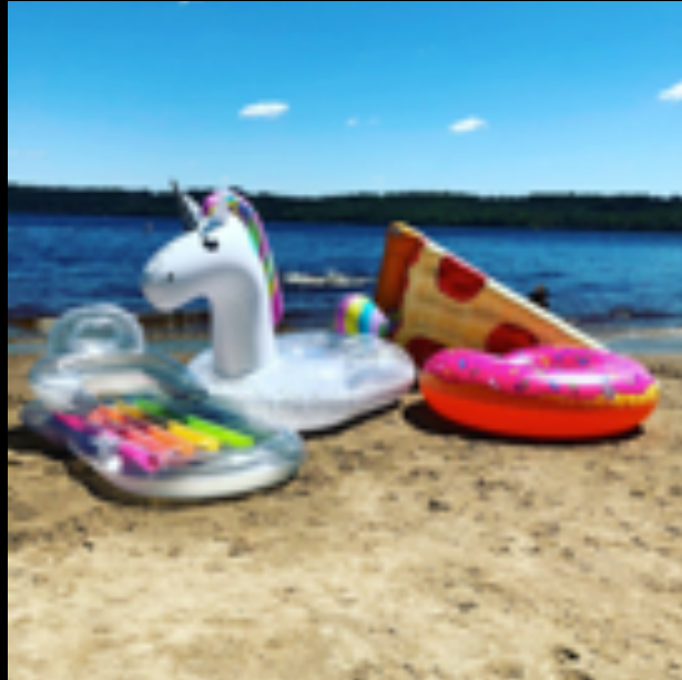
1. [Group] IMG_0266