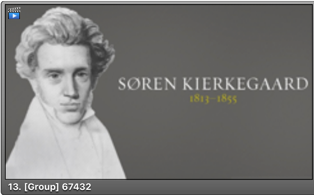
13. [Group] 67432