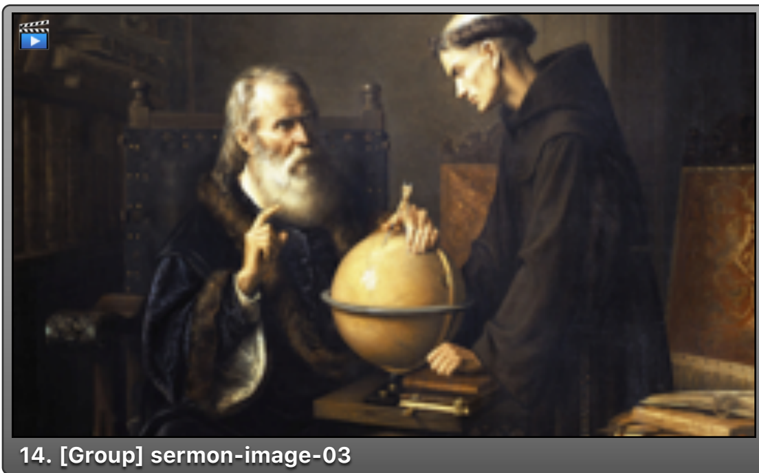
14. [Group] sermon-image-03