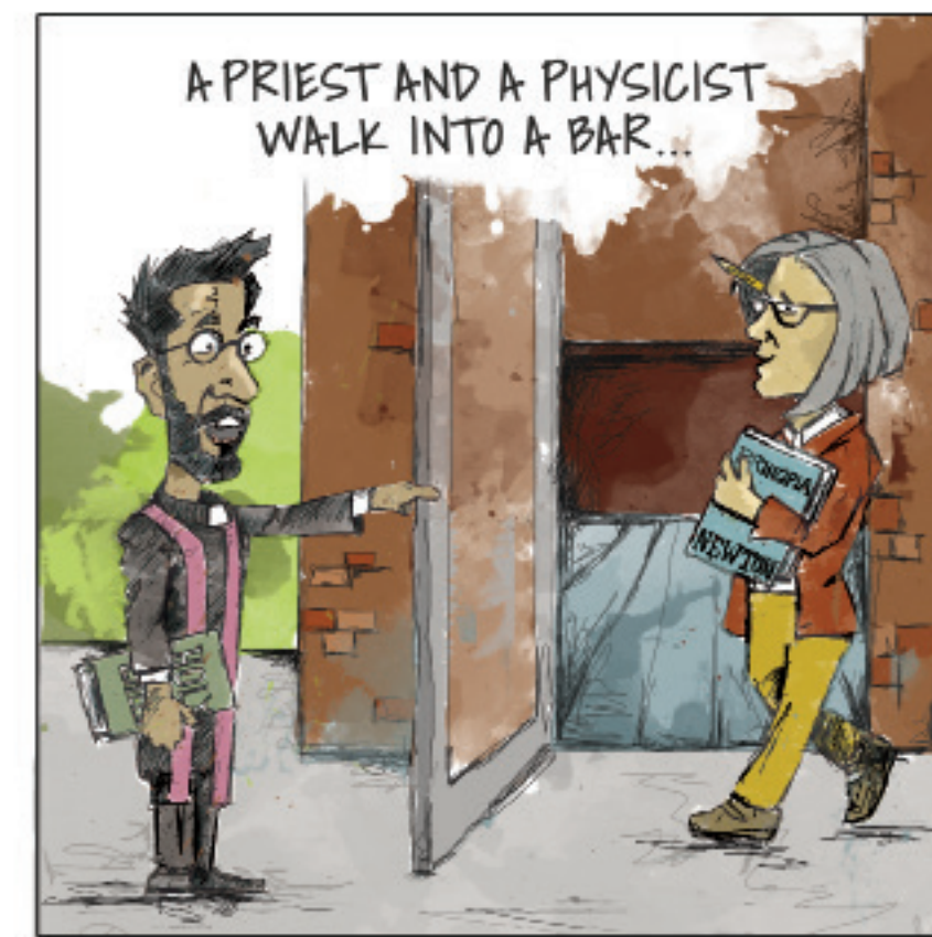
HOW SCIENCE AND FAITH CAN GET ALONG JAN 26-27