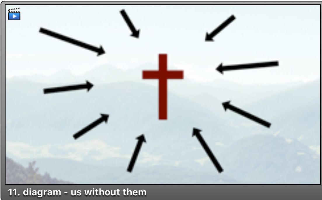
11. diagram - us without them