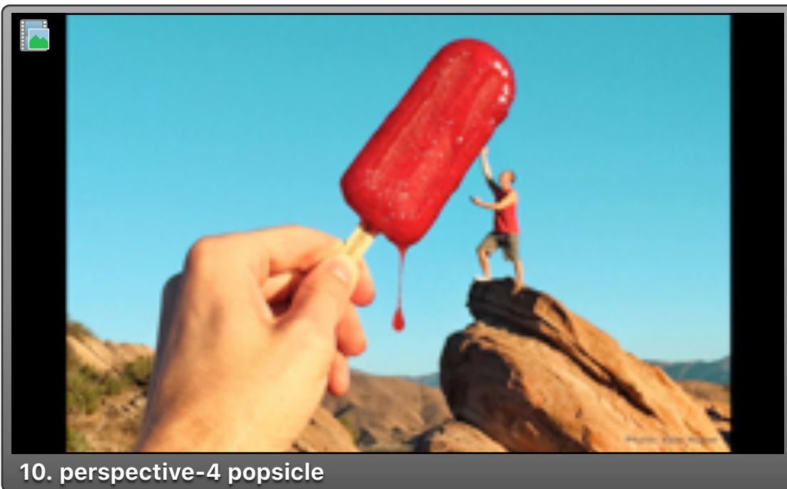
10. perspective-4 popsicle