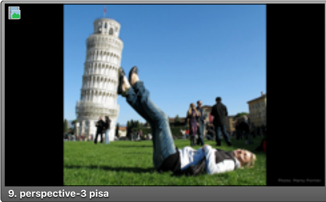
9. perspective-3 pisa