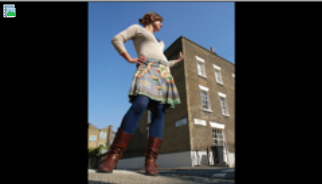
8. perspective-2 holding wall