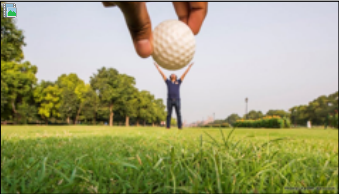
7. perspective-1 golf ball