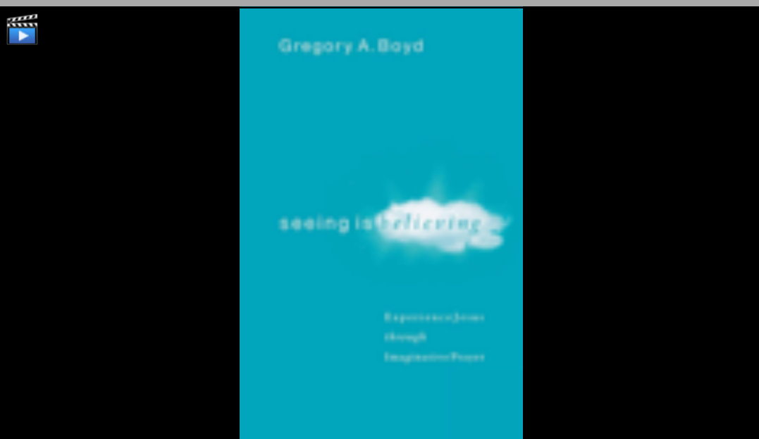
6. Seeing is believing