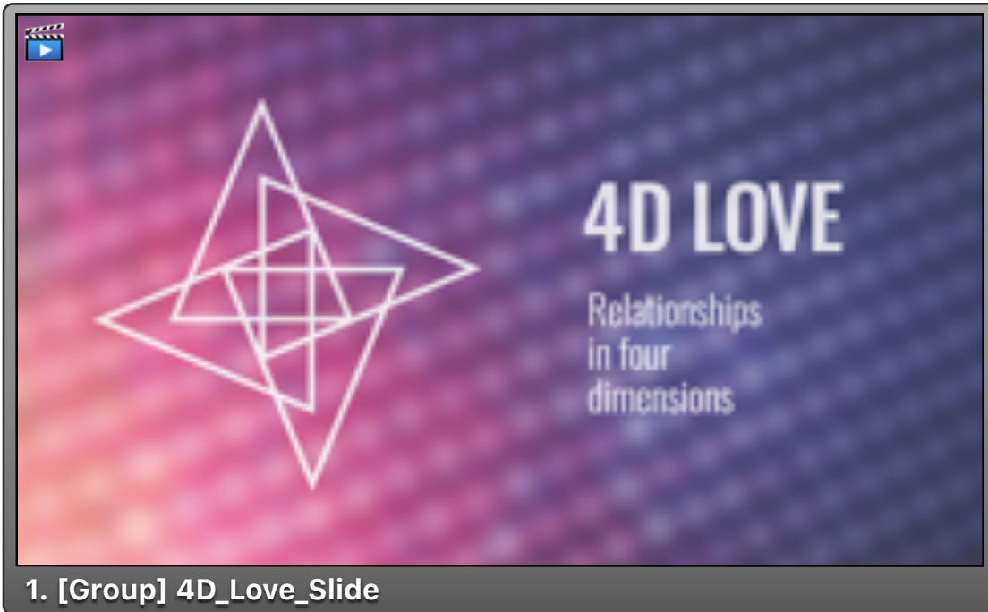
1. [Group] 4D_Love_Slide