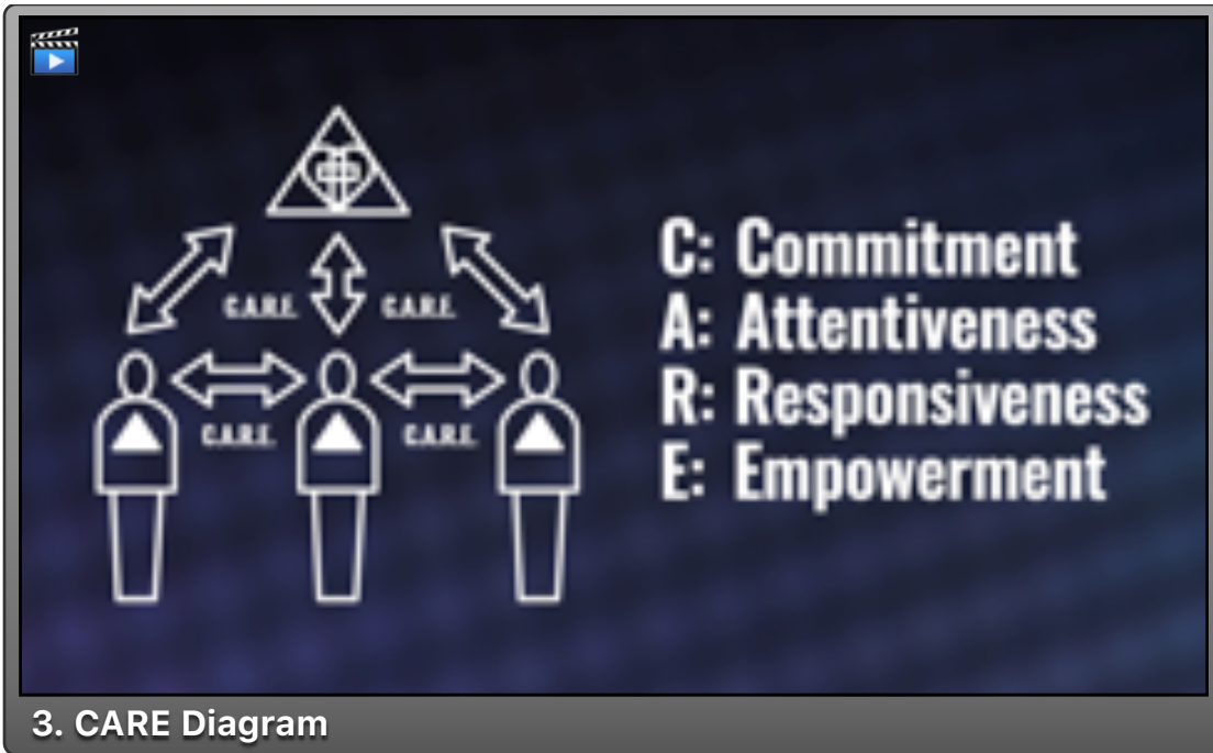
3. CARE Diagram

MATTHEW 22:37-40 He said to him, “You shall love the Lord your God with all your heart, and with all your soul, and with all your mind.’ This is the greatest and first commandment. And a second is like it: ‘You shall love your neighbor as yourself.’ On these two commandments hang all the law and the prophets.”